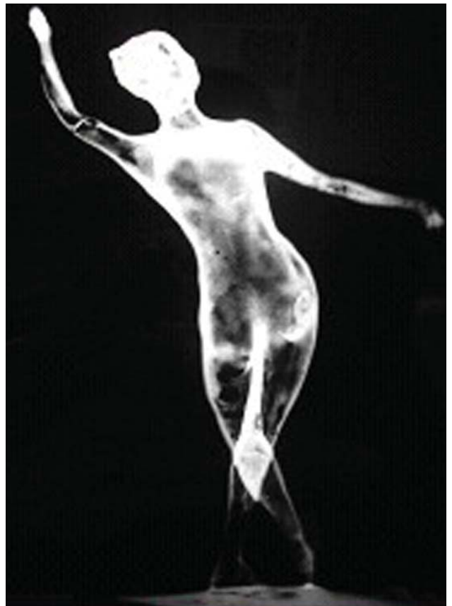
Degas bronze x-ray by Idries Trevathan

A summer internship programme with the Objects Conservation Department at the National Gallery of Art, Washington DC in 2005 showed me that to be a good conservator it is as important to learn how to work alongside the diverse group of curators, conservators, scientists and interns as it is to learn the technical skills and practical work in treating objects.