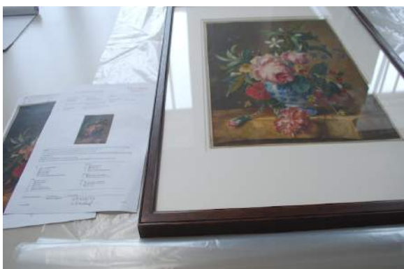
A returned loaned painting to Teylers in a display frame.

One of my duties at Teylers was to condition check objects coming in for the upcoming major exhibition “ At First Sight. ” This exhibition required objects from various other museums and so on a daily basis new loans were arriving to Teylers. I unwrapped the objects and created a condition report then prepared the object for storage before being put onto display. Additionally objects were being returned to Teylers from exhibitions elsewhere. In this instance I was asked to remove the object from its display frame, cut and peel away the Japanese tissue hinges and remove the artwork from the display mount. Once this was done I undertook a thorough condition report to check for any changes whilst the object was in the care of another institution, noting anything different or worrying.