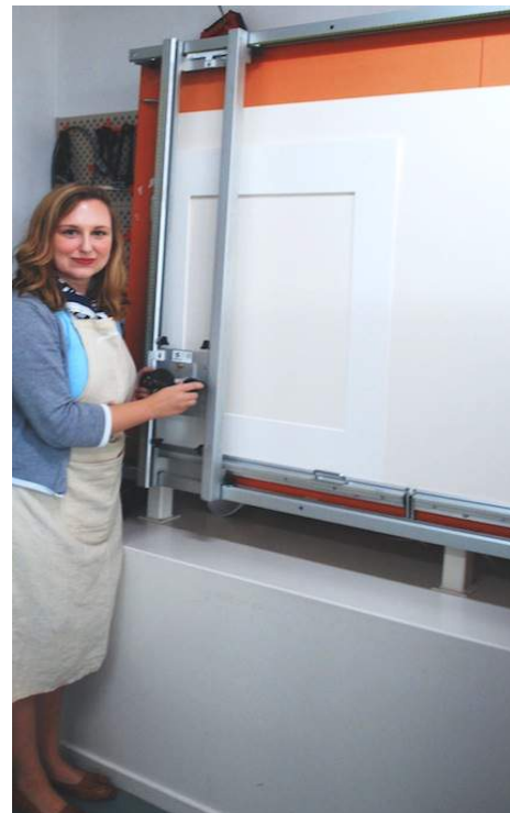
The wall mounted mount cutting machine.