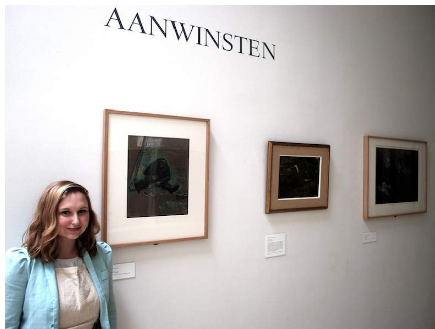
Installation of New Acquisitions exhibition.

Once I had created new mounts and fitted the drawings into matching frames it was time to begin the installation. A curator and gallery carpenter joined me in this process and for a while we discussed the best layout of the drawings and began measuring the walls for hanging. To prevent dust from spreading throughout the museum a vacuum cleaner was used to catch the powder when the walls were being drilled. Object handling skills are especially important during exhibition installations as the frames are heavy and need to be transported on a trolley from the 4 th floor of the museum down to the exhibition halls. I had to be very aware of my surroundings and work as a team when lifting the frames for hanging.