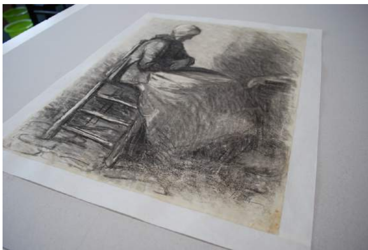
An example of a windmill false margin technique.

Once I had completed the backing removal and paper repairs I created four different false margin systems for the different drawings. The primary supports of the four drawings were of different thickness and size and so the paper selected to create the false margins and the technique differed for each one. A false margin is adhered around the edges of an artwork in order to assist with handling and when adhering hinges for display. The selected paper is adhered using methylcellulose, which is a slightly weaker adhesive and allows the margins to be removed easily without moisture. I was able to experiment using four different techniques; standard, windmill, overlapping and the French method, and was capable of choosing the correct weight of Japanese tissue or western paper to best suit the object's needs.