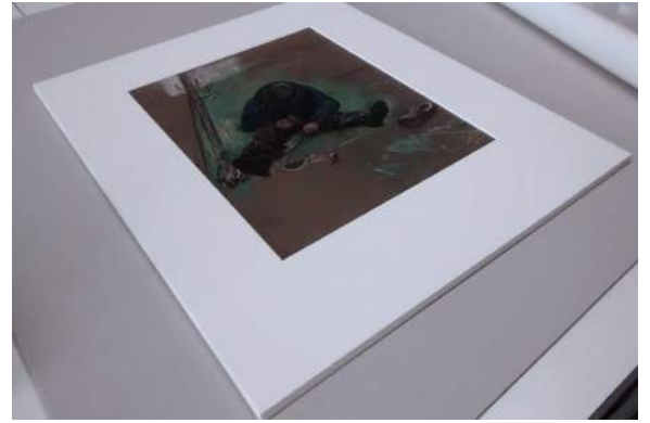
Completed window mount ready to be framed and put onto display.

Once I had created new mounts and fitted the drawings into matching frames it was time to begin the installation. A curator and gallery carpenter joined me in this process and for a while we discussed the best layout of the drawings and began measuring the walls for hanging. To prevent dust from spreading throughout the museum a vacuum cleaner was used to catch the powder when the walls were being drilled. Object handling skills are especially important during exhibition installations as the frames are heavy and need to be transported on a trolley from the 4 th floor of the museum down to the exhibition halls. I had to be very aware of my surroundings and work as a team when lifting the frames for hanging.