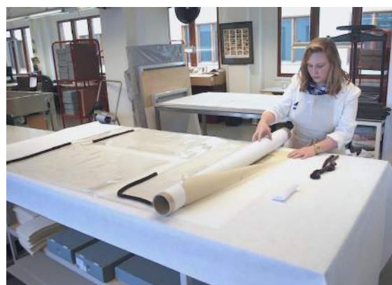
Humidifying architectural drawings.