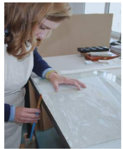
Application of MC to the edge of the drawing.