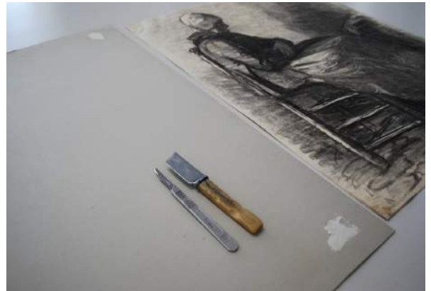
Backing removal of Douglas Hamilton charcoal drawing.

Once I had completed the backing removal and paper repairs I created four different false margin systems for the different drawings. The primary supports of the four drawings were of different thickness and size and so the paper selected to create the false margins and the technique differed for each one. A false margin is adhered around the edges of an artwork in order to assist with handling and when adhering hinges for display. The selected paper is adhered using methylcellulose, which is a slightly weaker adhesive and allows the margins to be removed easily without moisture. I was able to experiment using four different techniques; standard, windmill, overlapping and the French method, and was capable of choosing the correct weight of Japanese tissue or western paper to best suit the object's needs.