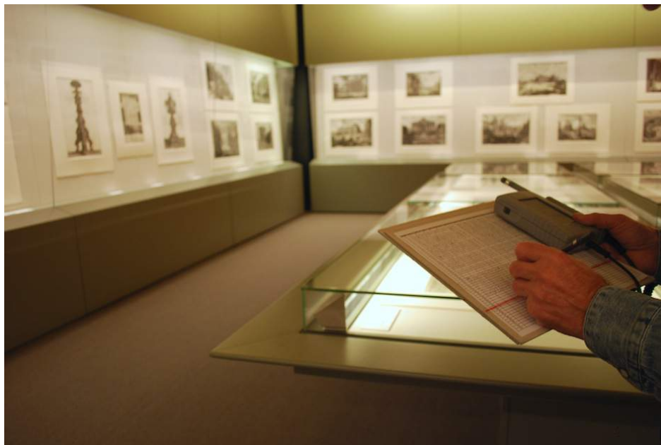
Environmental monitoring of the museum.

Like most museums Teylers suffers with pests and environmental issues. Luckily the museum does not have any major pest concerns, however traps are laid in the corners of the collection stores, which are also kept cool and relatively dry to prevent pests such as, paper-and silver-fish. The real concerns are the gallery spaces in the older part of the museum, which have natural lighting and limitations to environmental controls. Once a week I accompanied Erik whilst he undertook a detailed regime of environmental monitoring in regulated spots around the museum.