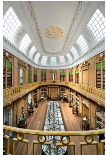
The Oval Room dates from 1786

I arrived in the Netherlands on Sunday 31 st of August and spent the first two days discovering a little of the Netherlands; I practiced my cycle route from Heemstede to Teylers Museum and located my nearest grocery store. As I was to start at Teylers on Tuesday 2 nd I took the chance to pop into Amsterdam on the Monday to visit The Rijksmuseum and FOAM photography gallery, taking in a little of the Dutch culture and way of life.