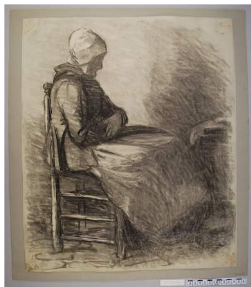
Before: Mrs Blanche Douglas-Hamilton charcoal drawing (note the discoloured corners) in need of backing removal.

After fully documenting the drawings I carried out condition reports and created treatment proposals. Most of the drawings needed some small paper repairs and for false margins to be attached before being remounted for storage. However one of the drawings, a large charcoal drawing, which had been backed onto poor quality board needed backing removal as the corners of the thin transparent paper were discoloured and causing stress to rest of the object due to the adhesive. Because the drawing was adhered only at the corners it was felt that the backing removal should be undertaken from the front, using a flat knife for better visual control and to save time.