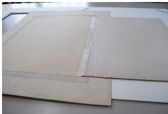
Removing hinges and display mount.