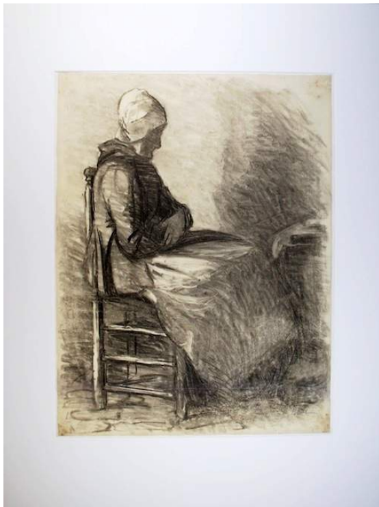
Blanche Douglas Hamilton charcoal drawing after conservation and remounting.

The false margins allowed for better handling and so I was then able to calculate the correct measurements for mounting. Teylers Museum use a wall mounted mount cutting machine, which I had never used before and so I spent many hours practicing to achieve the correct amount of pressure on the blade and to understand the measuring system. I found this machine to be rather challenging, however after many attempts I was able to measure and cut accurately. The style of mount at Teylers is to show the entire object and so the mount should be slightly larger than the artwork, which should be taken into account when making your calculations. Also with a thick or raised object, the window should be necessarily elevated by using two or three boards. During my time at Teylers I was asked to create a range of mounts not just for the Douglas Hamilton drawings but also for objects going back into storage or being put onto display; I became proficient and quick at the process.