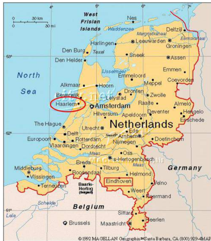
Map of the Netherlands highlighting Haarlem.

feel very welcome and helped me find my way around as well as lending me a bicycle and an Ov-Chipkaart (payment card for the transport system).