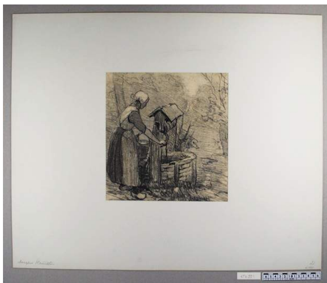
Before: Mrs Douglas-Hamilton black chalk drawing in an old mount.

My main goals for my internship at Teylers were to gain further experience of mounting and exhibition conservation. Because of this I was given four chalk and charcoal drawings to conserve and remount. These drawings were by a relatively unknown English artist called Mrs Blanche Douglas Hamilton; the condition of the drawings was good, with only a few small losses, tears and some slight discolouration and disfigurements to the corners caused by a cross-linked adhesive.