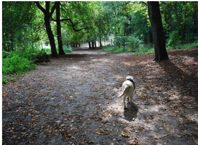
Walking Hasse, the Labrador in Heemstede woodland.