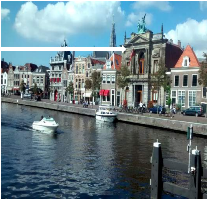
Teylers Museum, 2014

The museum is mostly lit by daylight, which evokes the atmosphere of a distant past when the exhibition rooms would have to close early on a dark winters afternoon because visitors could no longer see the artworks on display! Today the exhibition rooms have some external lighting for such occasions, however the conservation staff undertake weekly environmental monitoring to keep an eye on the temperature and humidity caused by the uncontrollable natural lighting and heat that penetrates through the glass skylights. The museum has seven exhibition rooms; the oldest part of the museum is the Oval Room, which was designed to accommodate all parts of the collection. However the more modern wings, which contain temporary exhibitions, are still very much in keeping with the older parts of the museum complex.