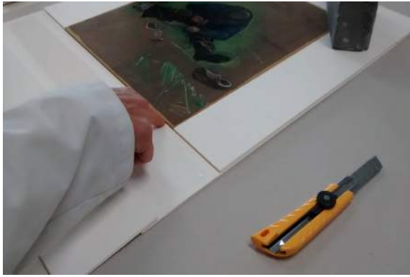
Layering pieces of mount board for the Jacobus van Looey drawing that was adhered to wood.