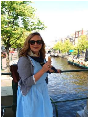
Enjoying a sunny day off in Leiden.

As Haarlem is so close to the beach, with wooded areas and only a short train ride to Amsterdam and Leiden I decided to spend my spare time exploring these local areas. In the evenings after I had cycled home from work I usually did a long walk in the Heemstede woods, or walked the dog, Hasse who belonged to my landlady. I loved doing these beautiful evening walks as they gave me time to think over what I had been taught during the day and appreciate my new surroundings.