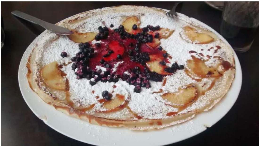
Apple and blueberry pannekoek

Whilst living in the Netherlands I tried to absorb myself in the Dutch language and culture, and spent a few evenings with my landlady, Marjon learning basic Dutch words and sentences. I found that I could pick up the language quite easily, however it was difficult to learn extensively as everybody speaks such excellent English. Yet, I tried my best to include myself where possible and found that I very much enjoyed the cultural delicacies such as salted herring, pannekoek (Dutch pancakes) and apple pie. Dutch chips are also very tasty, and I found myself occasionally buying some with a large squirt of mayonnaise on my way home from work.